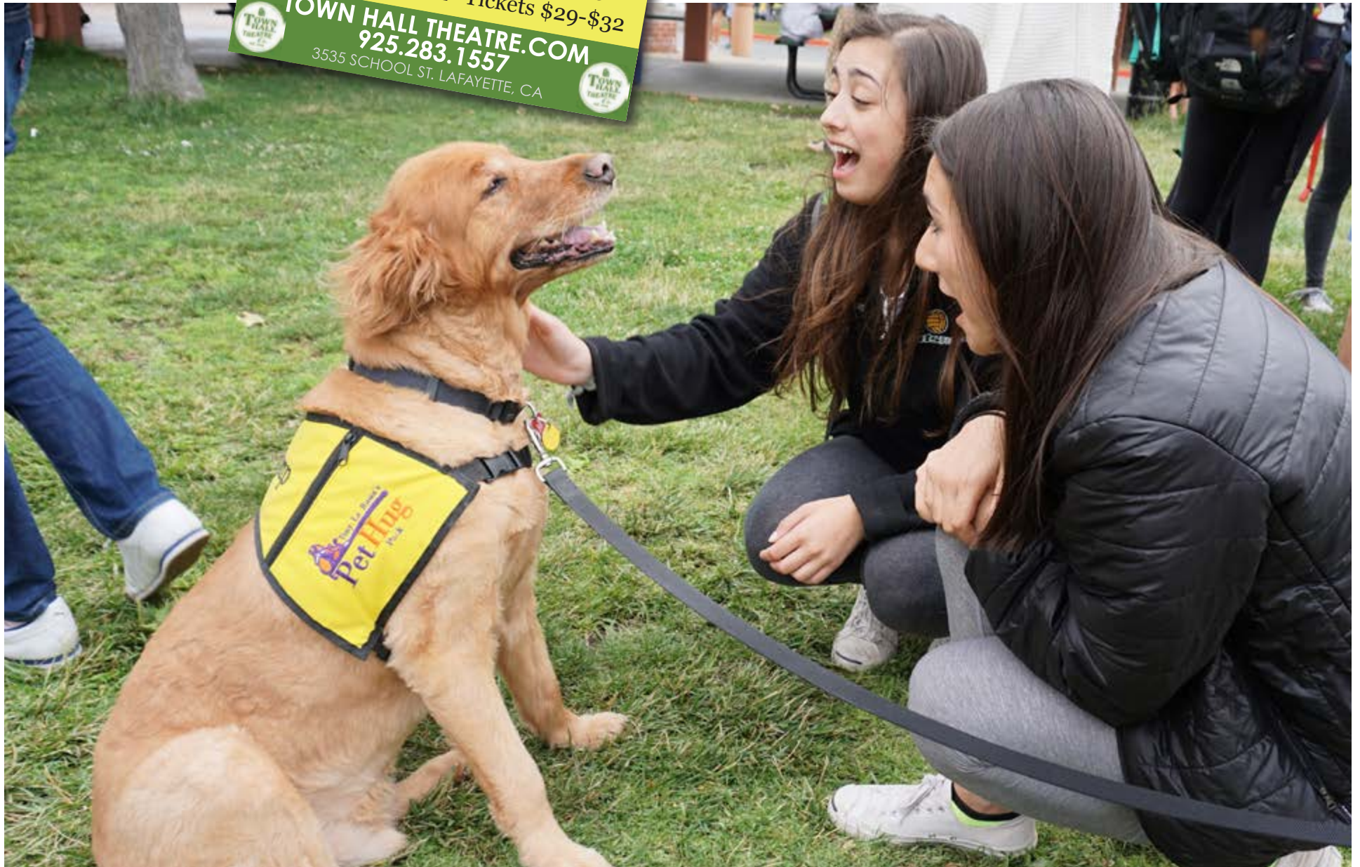
Miramonte High School students pet Therapy dog Tova, a golden retriever. A group of therapy dogs were made available to the school for stress-relief during finals week.